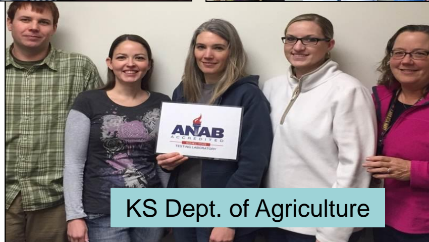
KS Dept. of Agriculture