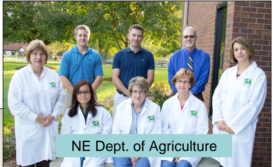
NE Dept. of Agriculture