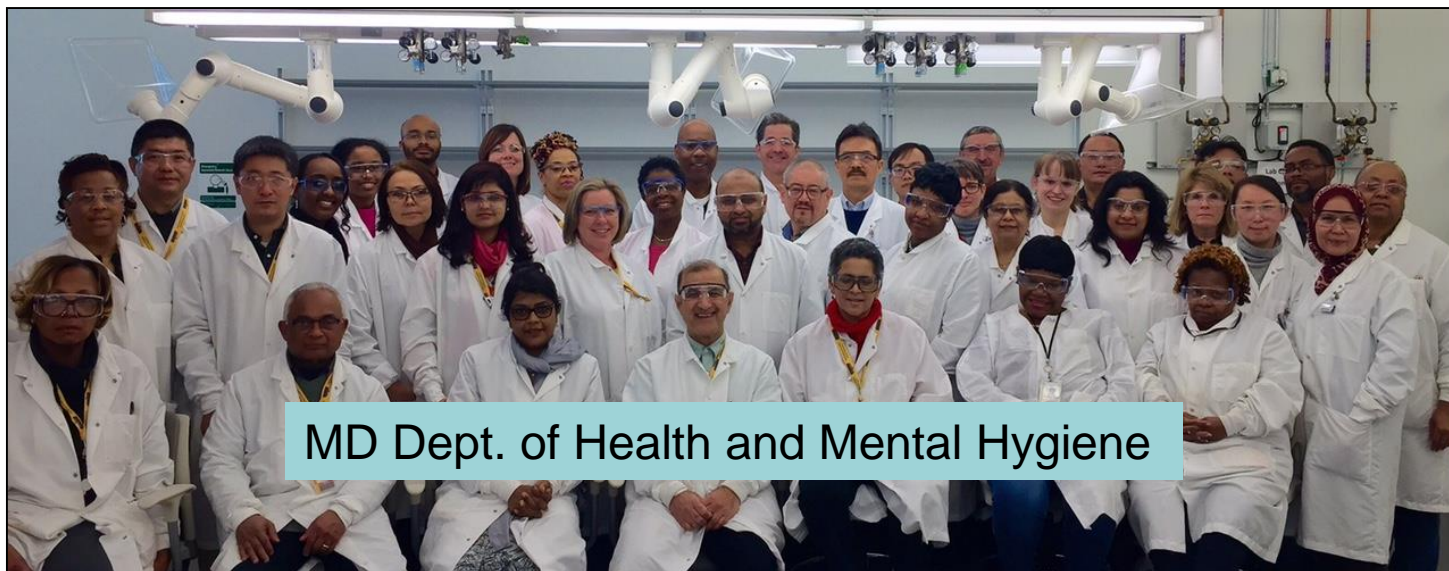
MD Dept. of Health and Mental Hygiene