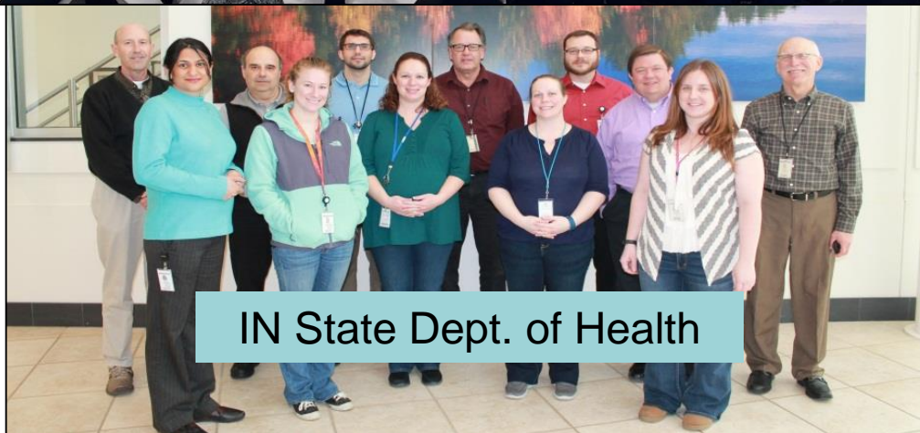
IN State Dept. of Health